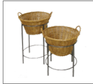
WICKER BASKET DISPLAY STAND LABEL