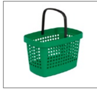
BASKET 28 L