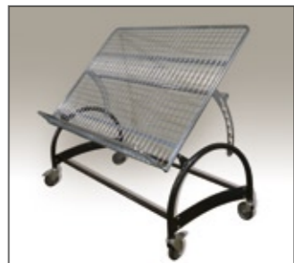
RAMP DISPLAY STAND