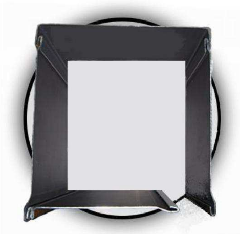
CAJÓN 4 PARTES/ HOUSING BOX 4 PARTS