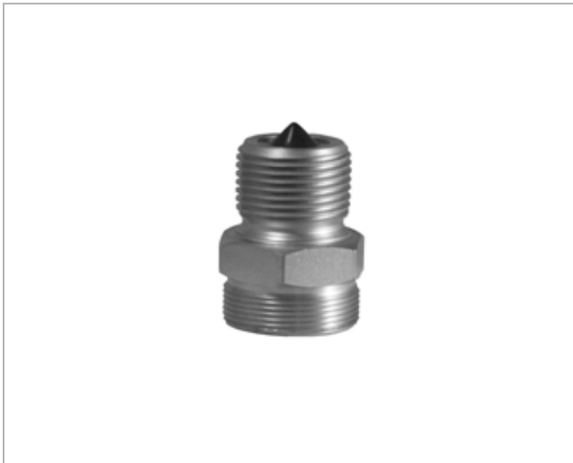
Screw-in part M20x1.5 short