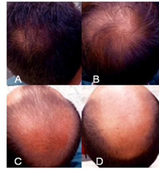
Figure 2. Patient classification based on appearance. A: Ideal outcome, B: Good outcome, C: Bad outcome, and D: Very Bad outcome.